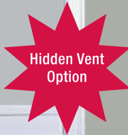
Hi-View Storm Door