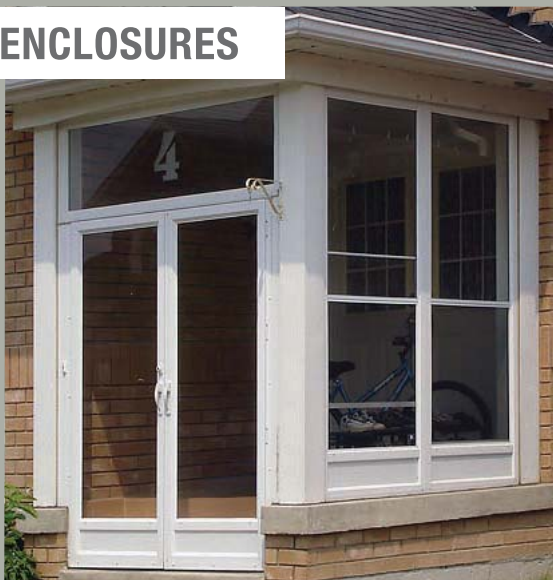
We specialize in custom built enclosures!