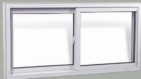
▲ SINGLE SLIDER WINDOW