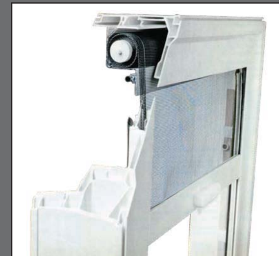
ULTRA ROLL SCREEN SYSTEM

For more information visit our website www.canadaglass.ca or call us at (416) 245-7032.