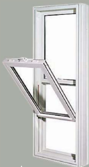
▲ SINGLE HUNG WINDOW