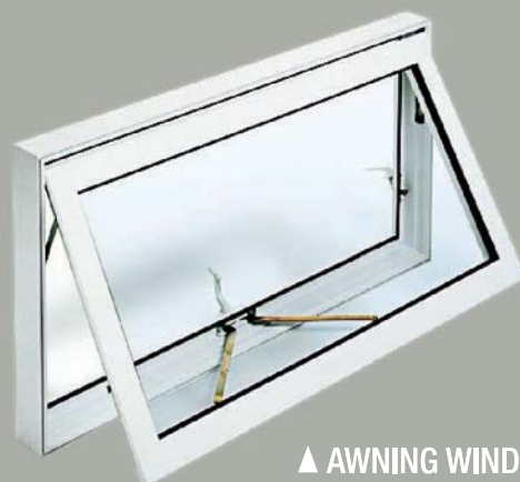
▲ AWNING WINDOW