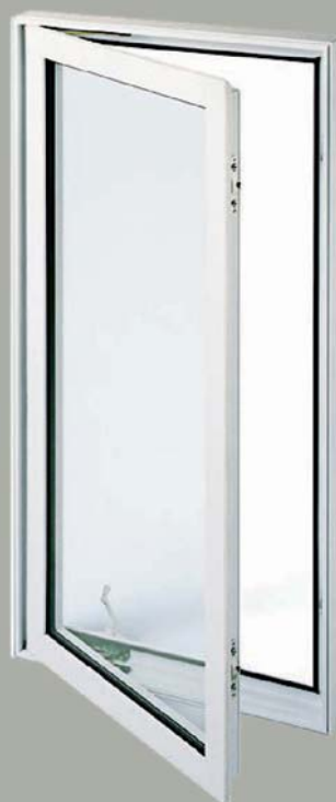
▶ CASEMENT WINDOW our most popular windows