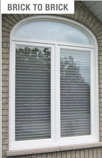
WINDOW INSTALLATION SAMPLES