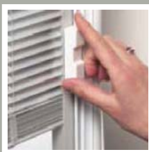
Raise & Lower Operator