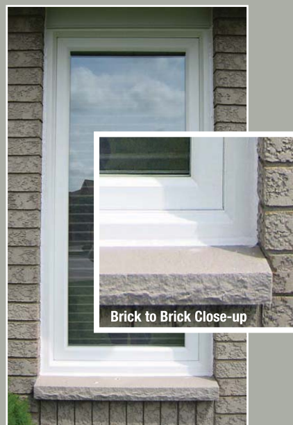
Brick to Brick Close-up