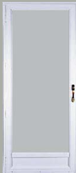
One Lite Storm Door